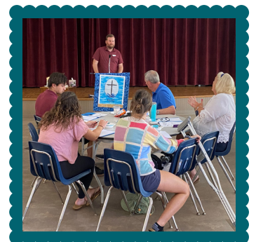
Participants in the July 1-day retreat pilot

Please see our brand new website, www.echoofcapecod.org for information about all our programs. Remember, they are open to anyone, regardless of prior retreat participation! Who in your life could use an invitation to meet Jesus through our Community of Love?